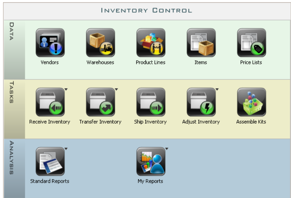
Intacct Inventory automates the entire inventory management process.

Intacct Inventory is fully integrated with our financial management applications, including Intacct General Ledger, Intacct Purchasing, Intacct Order Entry, Intacct Accounts Payable